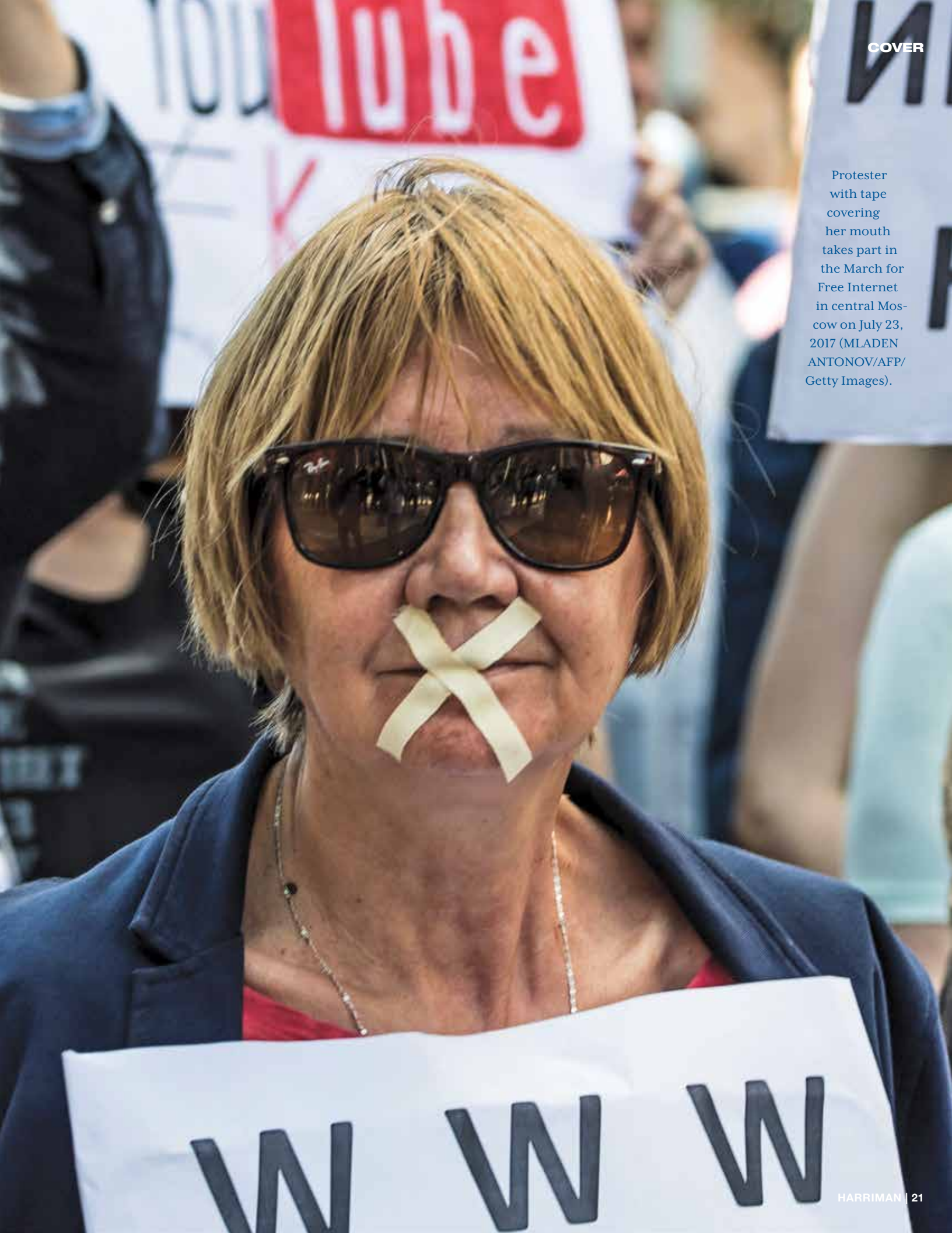
Protester with tape covering her mouth takes part in the March for Free Internet in central Moscow on July 23, 2017.