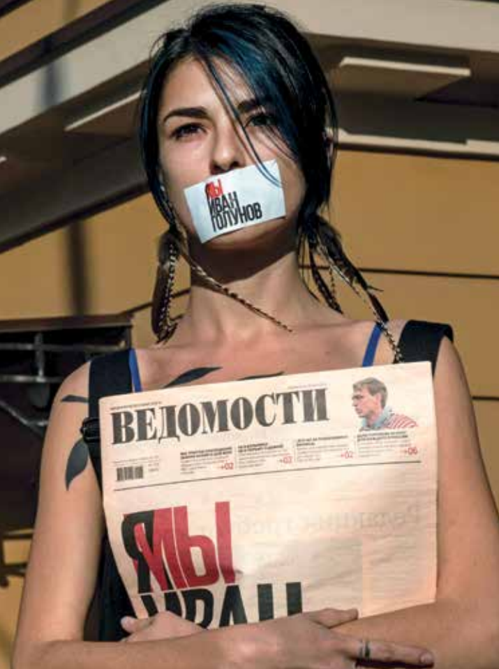
Top: A woman holds the Vedomosti daily newspaper with the front page reading “I Am (We Are) Ivan Golunov” during a protest outside the main office of Moscow Police (June 11, 2019).